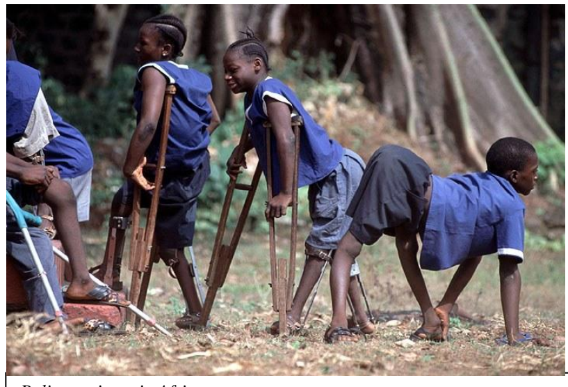
Polio survivors in Africa.

As for Rotarians, for more than a quarter century club members have donated their time and